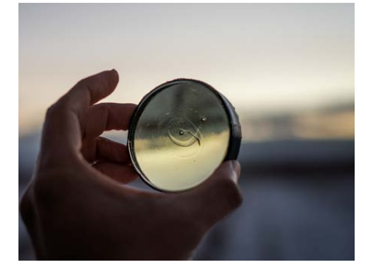
Solaris, 2017. Oscar Santillán

So, what is the IVM? It is an attempt to allow us, humans, to engage with the vast otherness inhabiting Earth by amplifying care rather than coercion. Therefore, the IVM is an interface for decentralized cognitions to relate to each other and/or to express themselves.